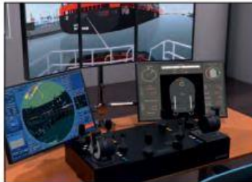
Desktop Tug Trainers