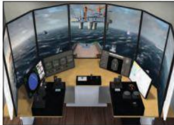
Desktop OSV and DP Trainers