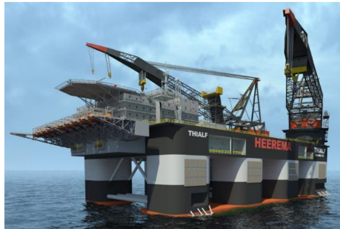
ENGINEERING / RESEARCH